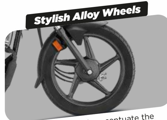
Stylish Alloy Wheels All-black alloy wheels accentuate the overall look of the bike.